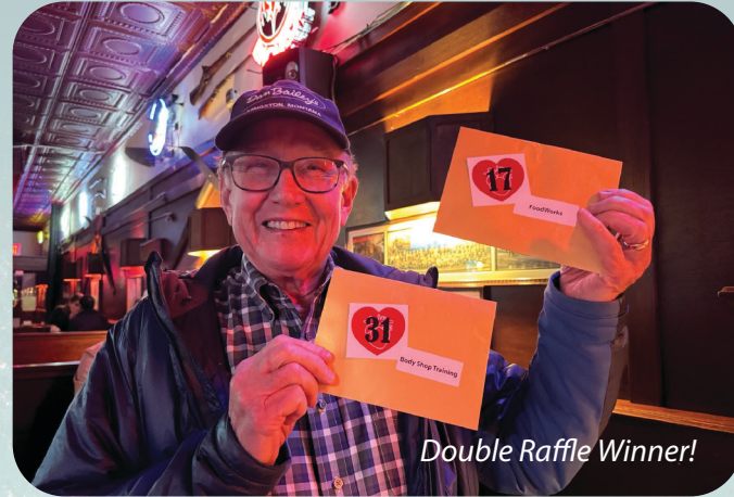
Double Raffle Winner!