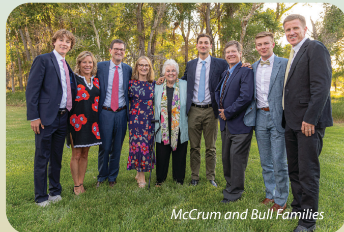
McCrum and Bull Families